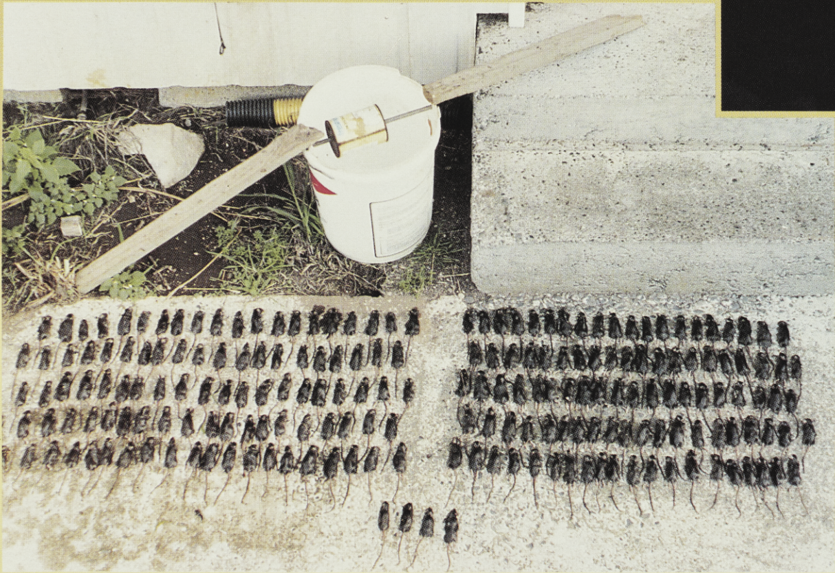
Time magazine was not far wrong in its description of the extent of the Mana Island mice plague. A simple bucket trap laid one night a year ago by Mana Island field staff saw a catch of 204.