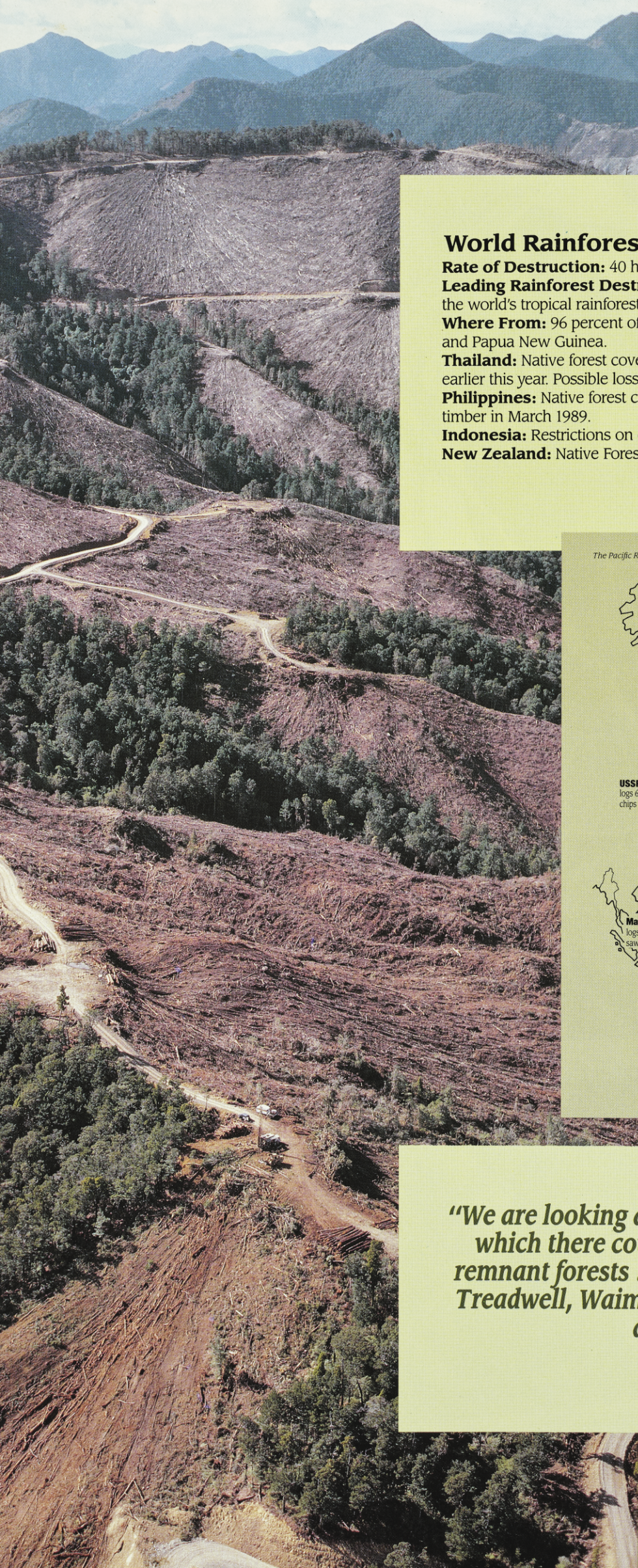
Clearfelling for woodchipping, August 1989, adjoining the Tinline Scenic Reserve in Marlborough.