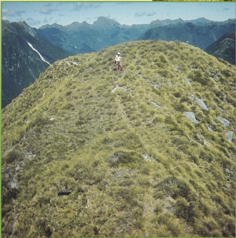
The well worn kakapo path on Saddle Hill, George Sound, in 1956. By 1989 the same path had become overgrown, sad sign that kakapo had disappeared from the area.