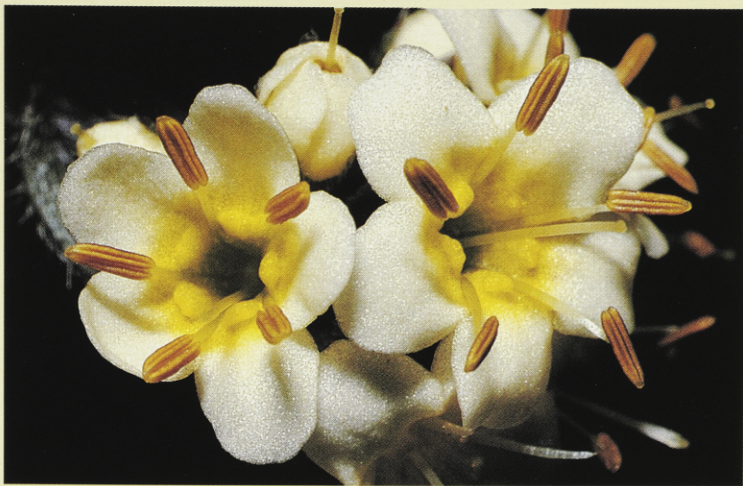
An alpine forget-me-not, Myosotis monroi .