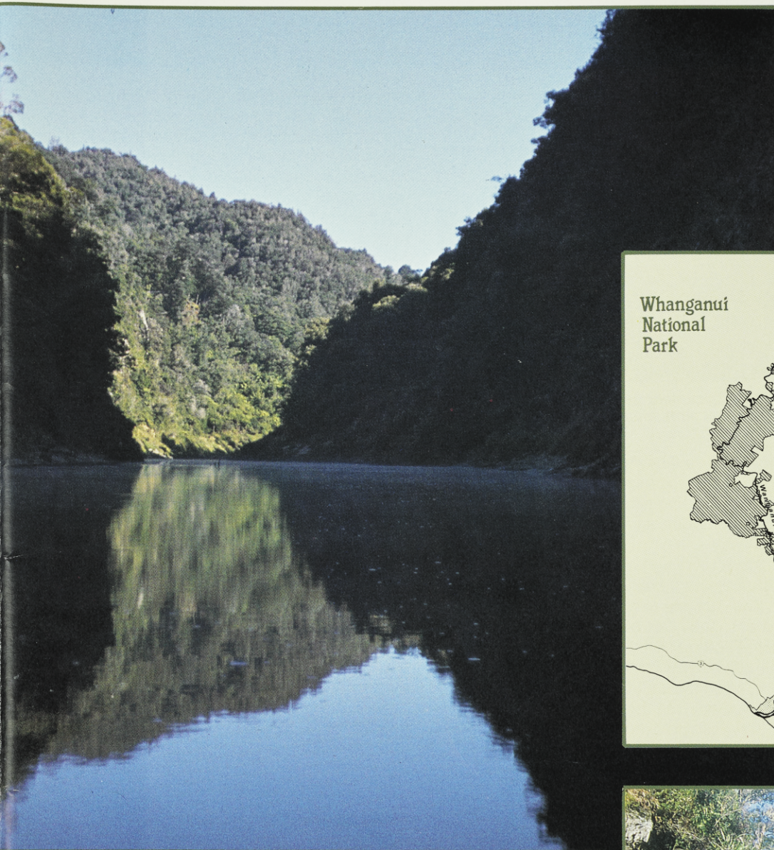
The Wanganui River in one of its quieter moods. At 329 kms in length, it is New Zealand's longest continuously navigable river.