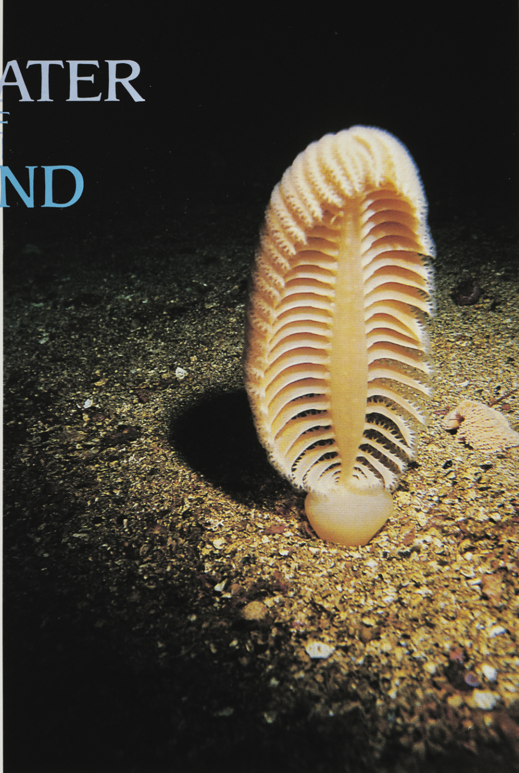
The fiords are the only places in New Zealand where a diver will come across a sea pen ( Sarcophyllum bollonsi ), although even here they are restricted to sand slopes in depths below 20 m. Height 30 cm.

Rock lobsters are common in the fiords since the sheer rock walls prevent fishermen from laying pots.