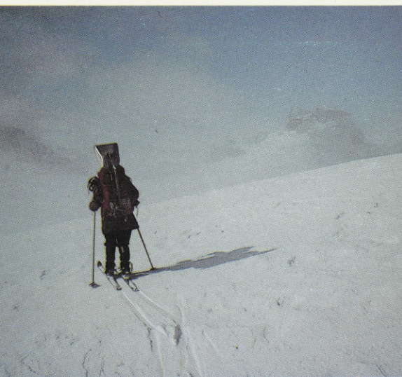
Ski touring on the summit of the Garvie Ranges