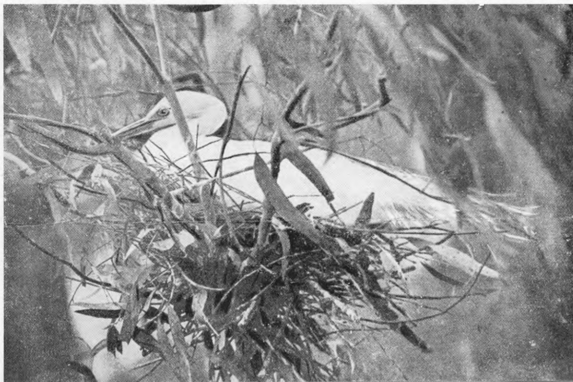
EGRET ON NEST.