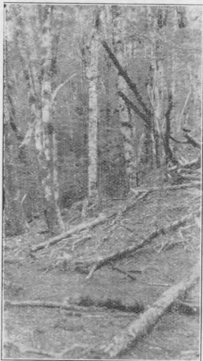
Mountain beech of Otago laid waste by deer.

A good few thousands of the pests have been killed during the past three years in limited areas, but the tally of the slain would be far short of the natural increase, because those alien animals have no natural enemies in the forests. Sir Alexander Young (Minister of Internal Affairs), with a full knowledge of the havoc wrought by deer, has rightly declared a war of extermination against them, but he lacks the funds for the