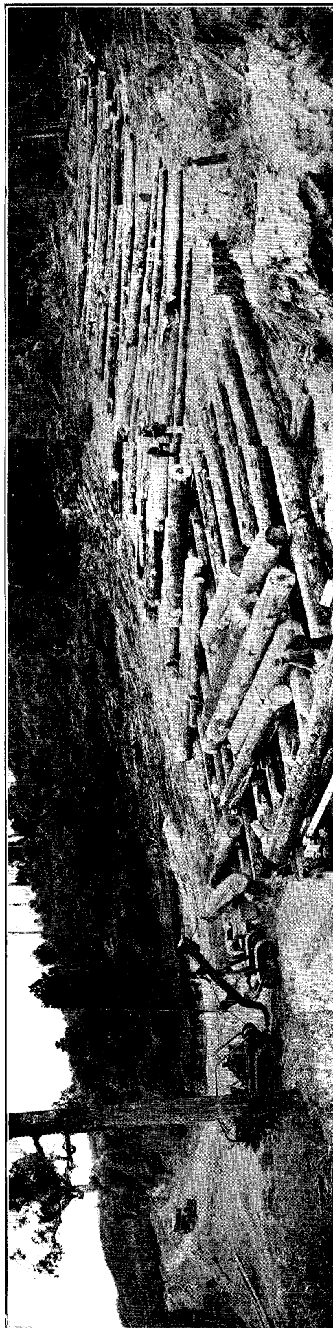
PLATE 15.—LOG DUMP AND SKIDS, SHOWING TRACTOR AND LOGGING-ARCH.