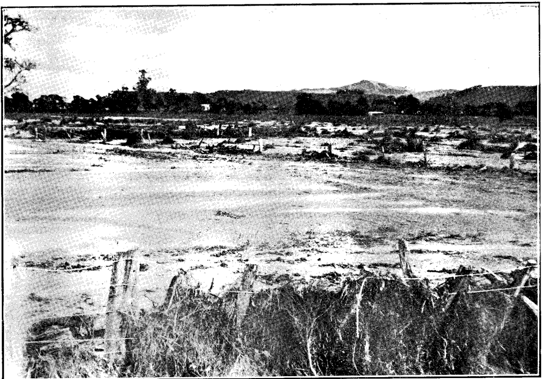
39. TIKITIKI SCHEME: ANOTHER VIEW OF RECENT FLOOD DAMAGE.