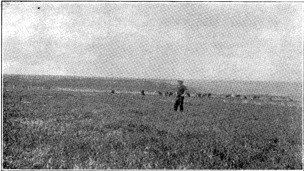
No. 2.—SAME AREA ONE YEAR LATER, IN GOOD GRASS.