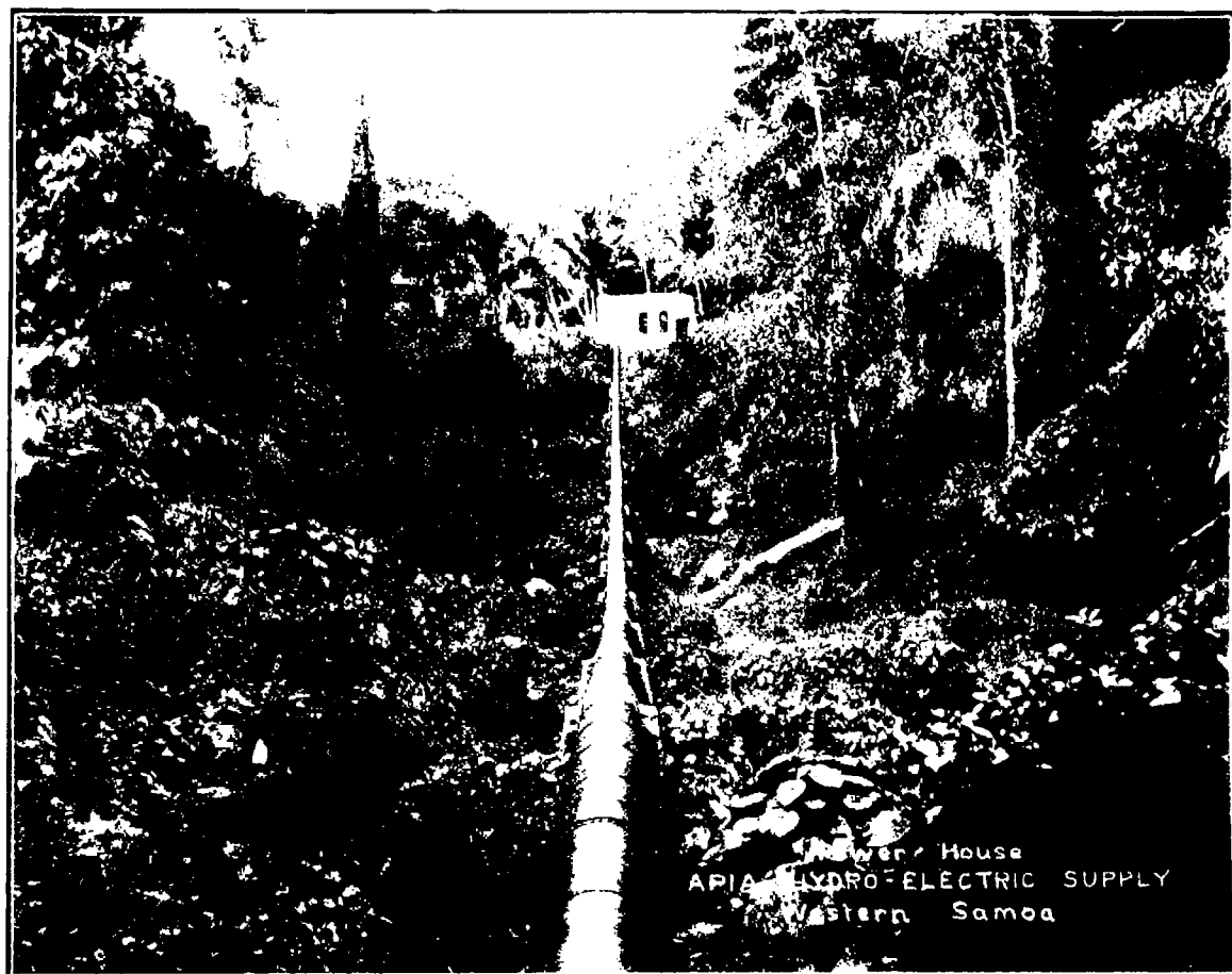
VIEW OF THE POWER-HOUSE, SHOWING THE LAST STRETCH OF THE PIPE-LINE.