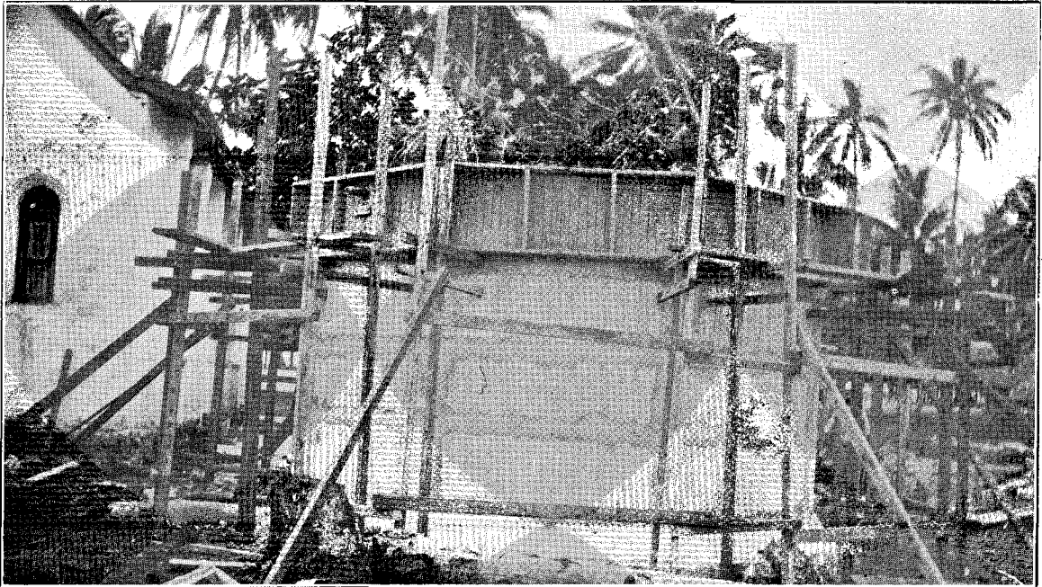
CONCRETE CISTERN IN COURSE OF ERECTION AT FALEALUPO.