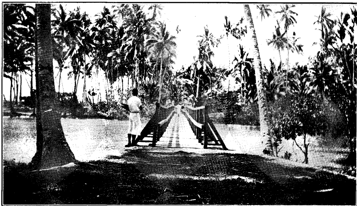
NEW BRIDGE AT LANO, SAVAI'I, CONSTRUCTED WITH SAMOAN TIMBERS.