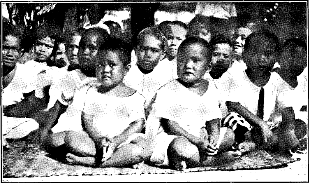
GROUP OF TOKELAU (UNION) ISLAND CHILDREN. (The chief foods of these islanders are coconuts and fish, a diet on which the children thrive.)