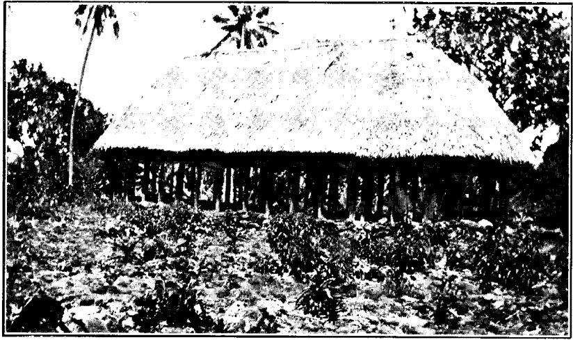
FIG. 12.— Fale at Safotu, built by the Natives as a dispensary hospital. Figs. 13 and 14 show interior views.