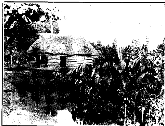
FIG. 9.—House and taro swamp, close to centre of Apia.