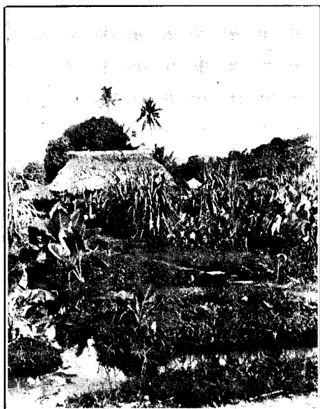
FIG. 8.—Taufusi Swamp, showing taro and tamu plants in which Pinlaya kochi breeds.