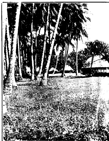
FIG. 11.—Coconut-palms with steps cut in them.