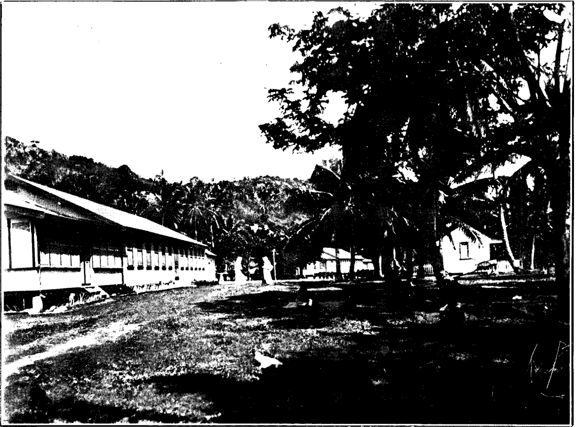
FIG. 2.—Leper Asylum, Makogai, Fiji. Photograph showing hospital in foreground and women's quarters in the distance. The leper island is in charge of a Medical Officer of the Fiji Medical Service, and the nursing staff belong to a Roman Catholic order—the Society of Mary.