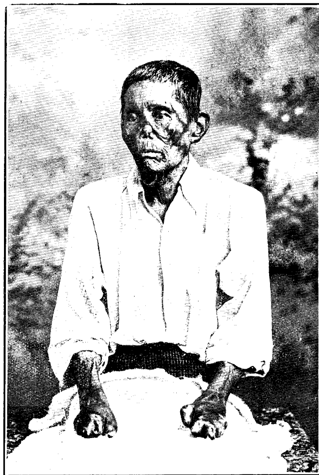
FIG. 13. Photograph of a Hawaiian, one of the first cases definitely diagnosed as leprosy in Western Samoa.