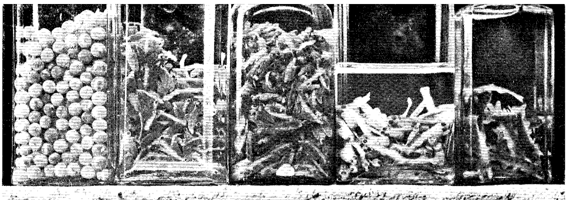
FIVE STAGES OF SALMON-CULTURE.