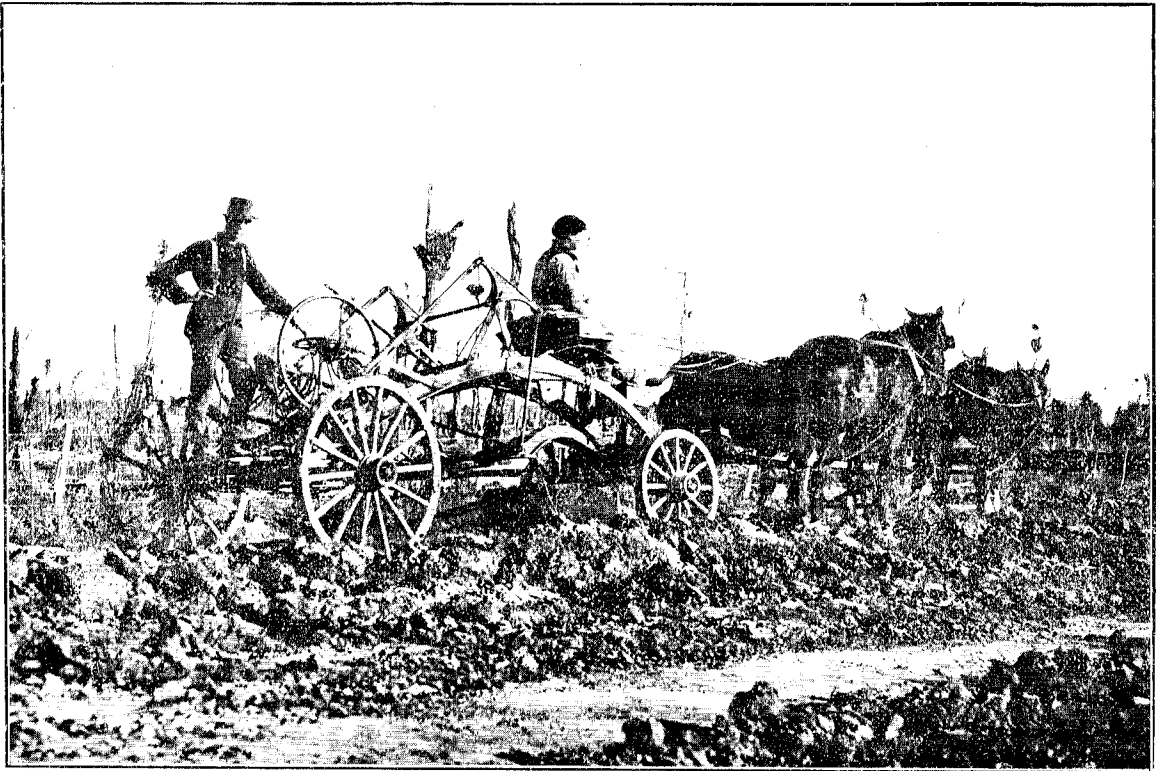
"AUSTIN" ROAD-GRADER FORMING UP ROADS.