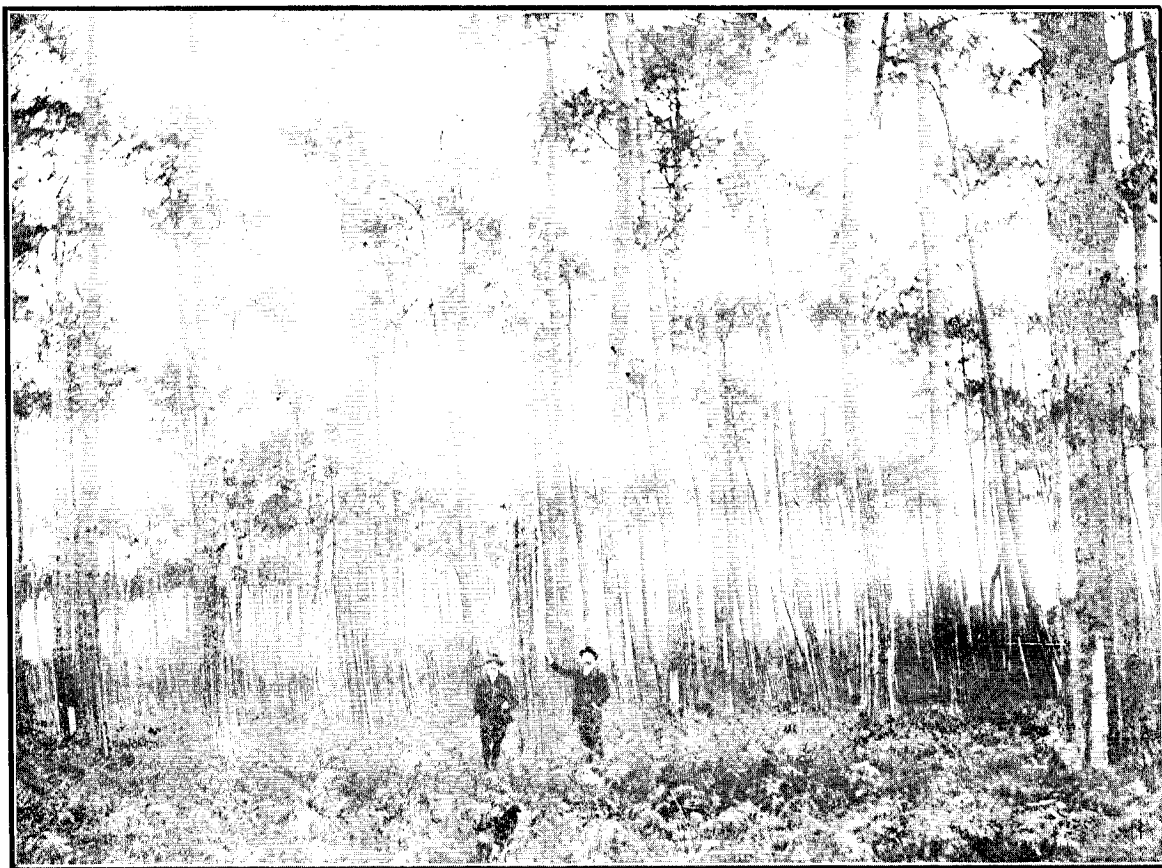
NATIVE FOREST OF PINE MARITIME NEAR BAYONNE (FRANCE).