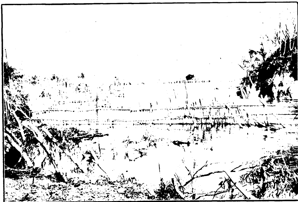
TARAWERA RIVER. — ENTERING THE FIRST LAKE. MOUNT EDGECUMBE AT BACK.