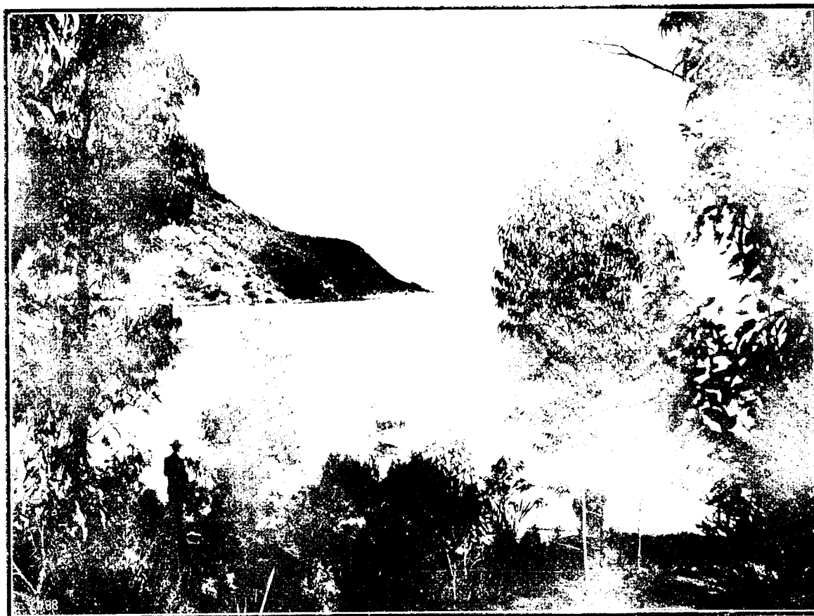
Paul's Cove, Port Antonio