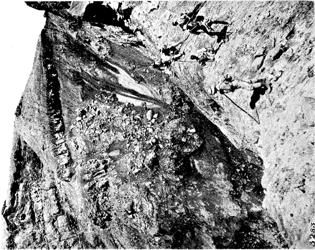
LOOKING INTO THE CRATER OF NGAURUHOE FROM CASTLE ROCK.