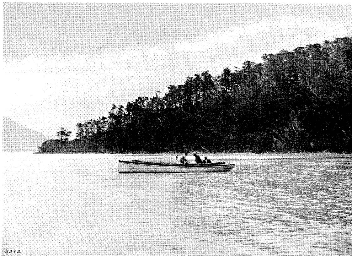
ORIERI SCENIC RESERVE, PELORUS SOUND.