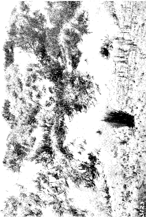
No. 30. SAND-SHRUB DUNE WITH SMALL PORTION OF SAND-PLAIN IN FRONT. DUNES OF WESTERN WELLINGTON.