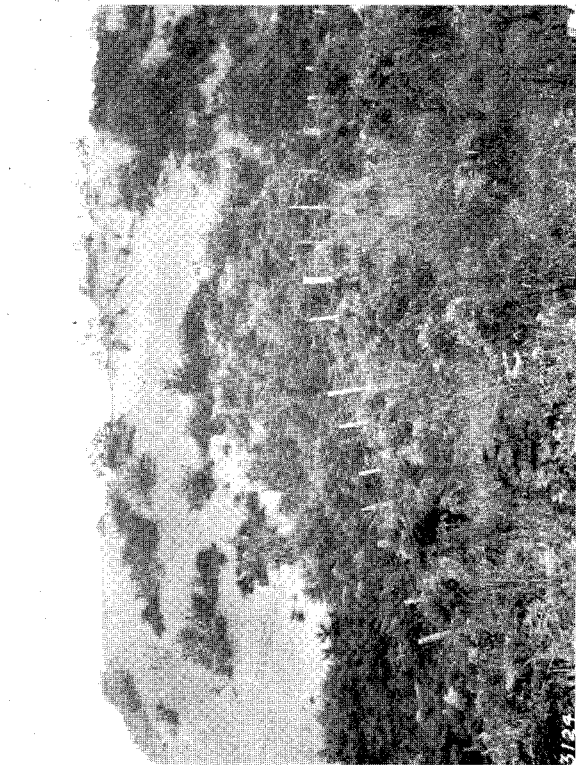
No. 31. FIXED DUNE, WHICH HAD BECOME ACTIVE THROUGH DAMAGE BY SHEEP, GETTING NATURALLY RECLOTHED BY PLANTS.