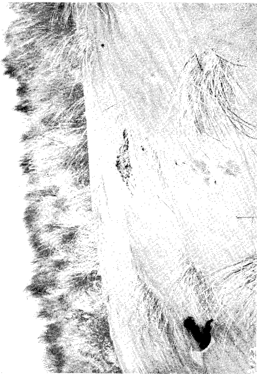
No. 29. A CLOSE GROWTH OF MARRAM-GRASS IN PROCESS OF DESTRUCTION BY A VERY ACTIVE SAND-DRIFT.