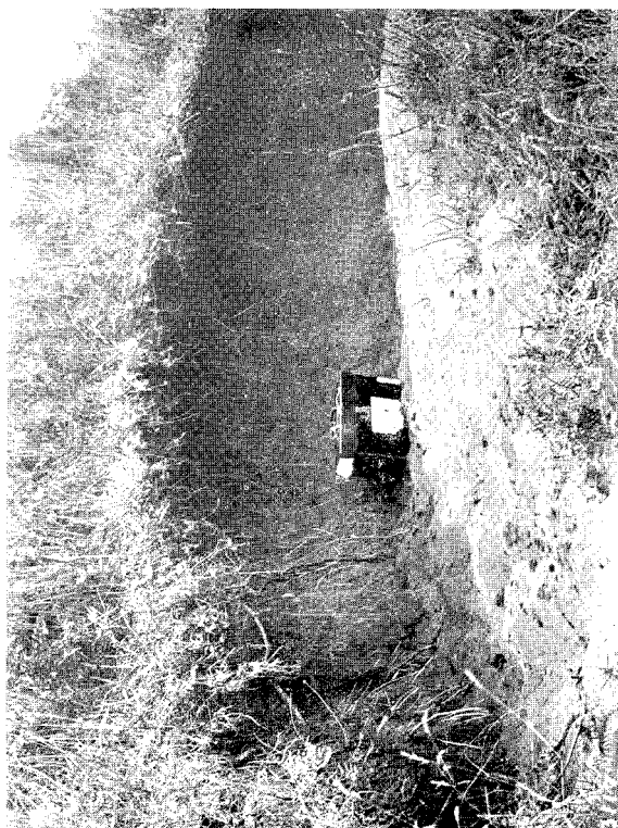
No. 24. FIRST STAGE IN HISTORY OF A WANDERING DUNE: HOLE MADE BY SHEEP. 5 BY 4 CAMERA-CASE FOR SCALE.