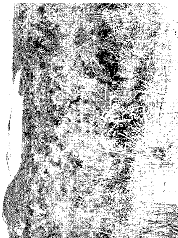
No. 23. DUNE NATURALLY FIXED REVERTING TO THE ACTIVE STAGE AT SUMMIT. SHRUBS IN FRONT CHIEFLY Cassinia leptophylla .