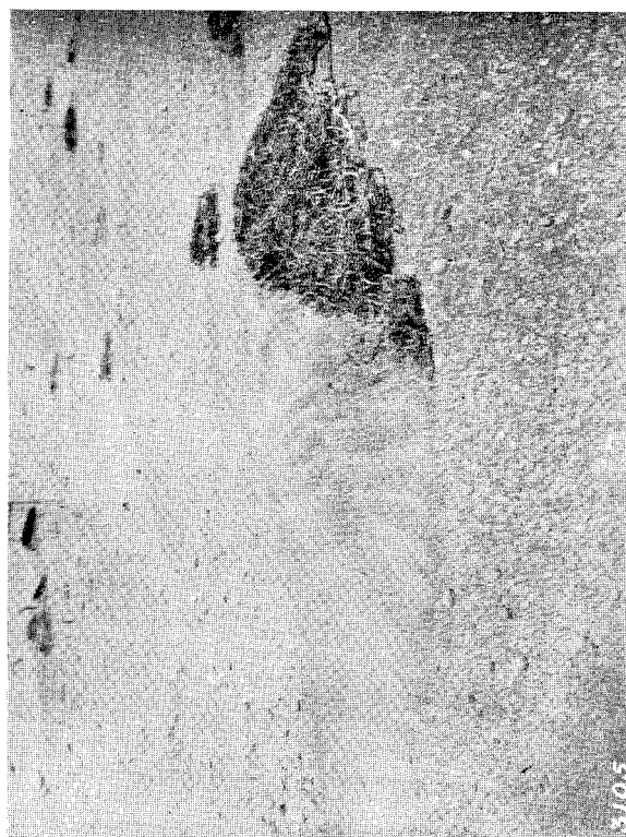
No. 12. TONGUE OF SAND IN LEE OF PROSTRATE SHRUB ( Coprosma acerosa ) ON STONY DESERT, SOUTH OF WANGANUI.