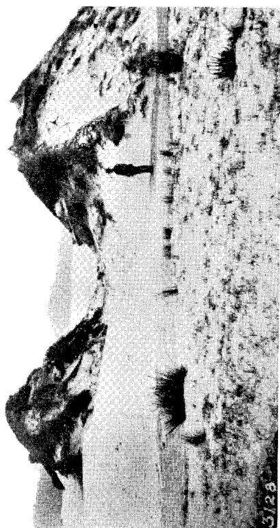
No. 9. SAND-PLAIN IN WHICH DRIFTING SAND IS BEING FIXED BY Carex pumila . WIND-CHANNEL AND WRECKED DUNES IN CENTRE.