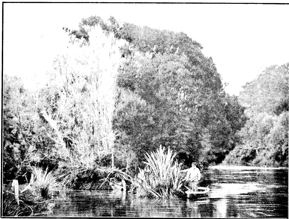
TUATAPERE, OR MANUKA ISLAND, WAIAU RIVER. (Resolution 225.)