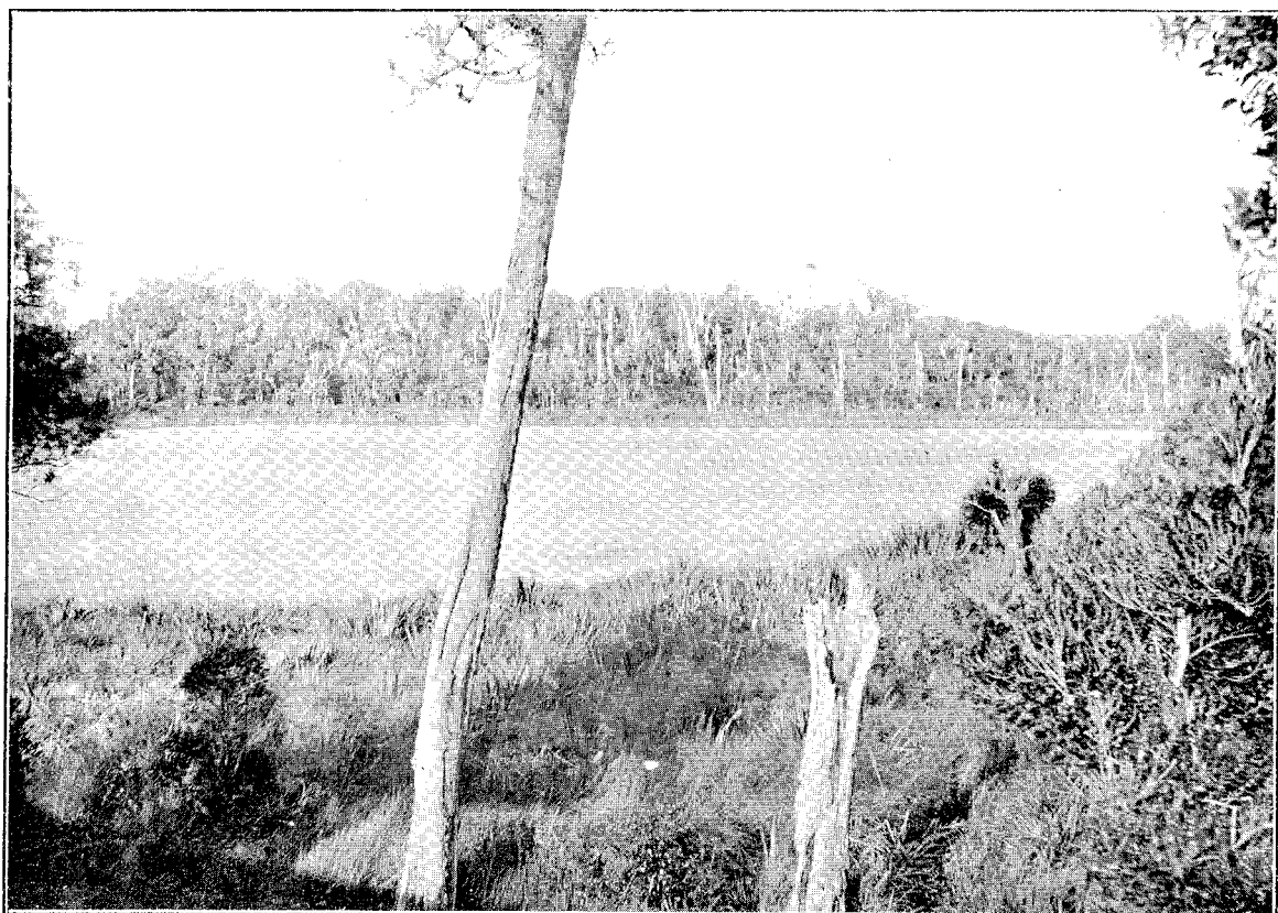
BARRETT'S LAGOON, ORAPEPE (WAIKARE LAKE). (Resolution No. 2.)