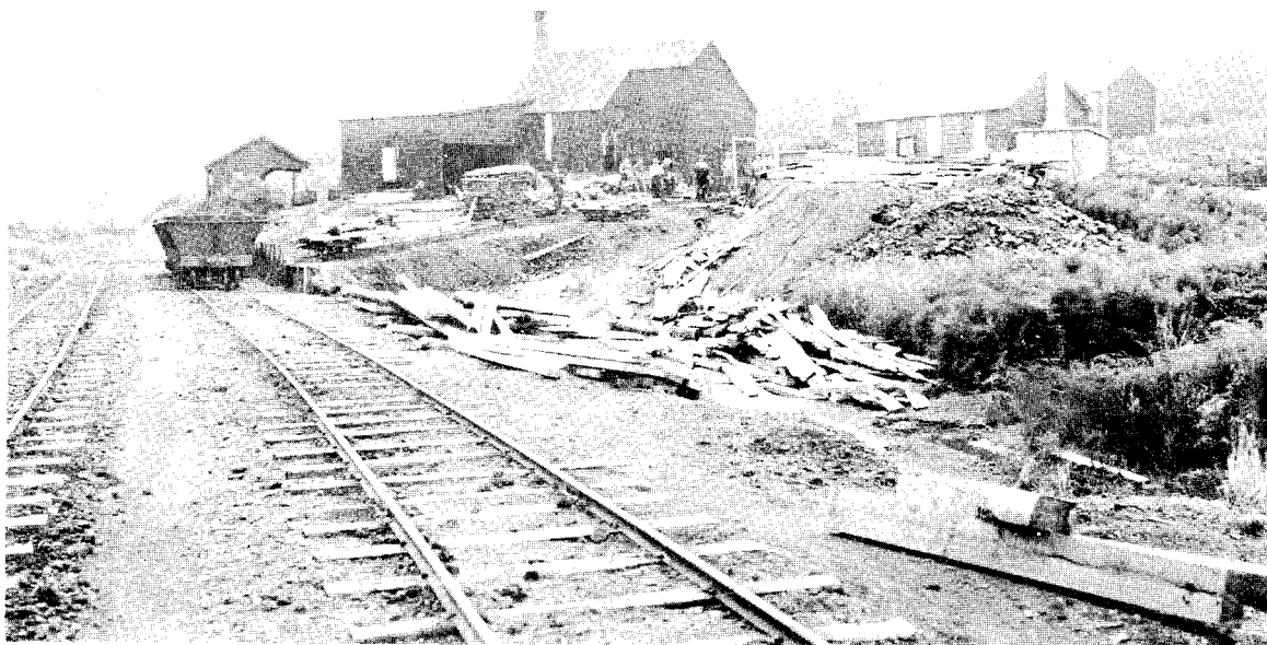
Railway siding, Hikurangi Coal Company's Mine, Hikurangi