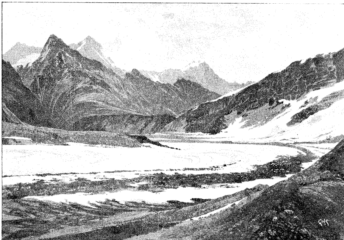
Looking down McKerrow Glacier from Douglas Pass.